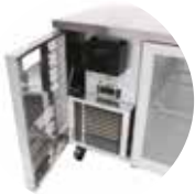
Removable refrigeration cassette