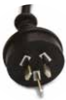
10 Amp power

The Australian Made Boronia self-contained have been designed for the testing demands of busy venues to operate efficiently, to maintain temperature as products are taken out, stock replenished and doors continually opened and closed.