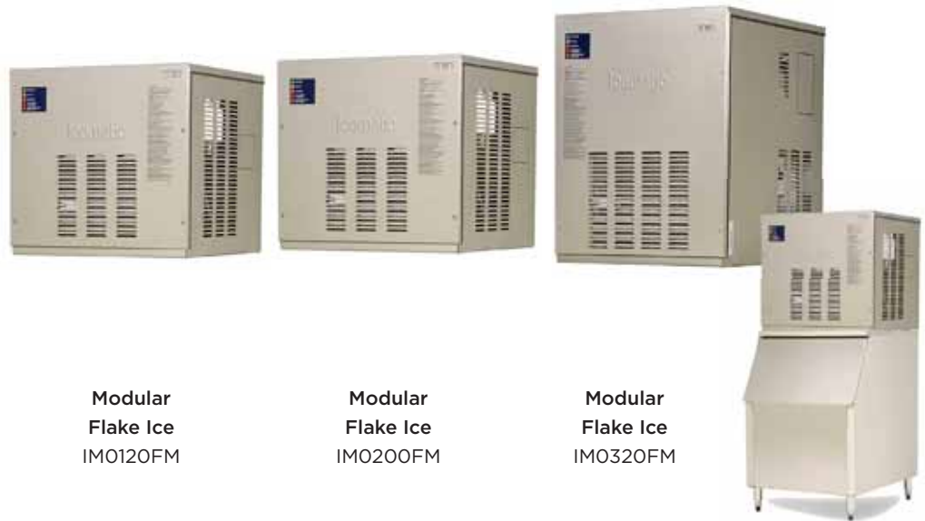
Modular Flake Ice IM0120FM