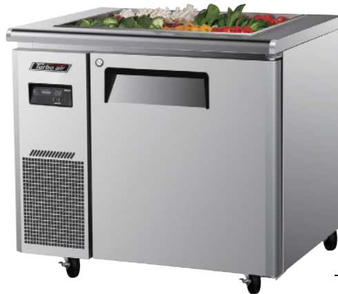
- Pans not included.