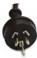
10 Amp power

Our Australian made and designed Banksia counters are engineered to perform in the harshest environments that kitchens can dish up. They are designed to highlight your fresh ingredients while providing you quick and easy access.