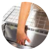
Removable air ducts